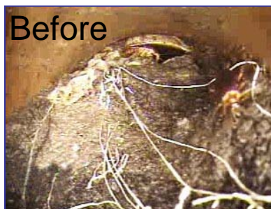
Simply cleaning the pipes and manholes in preparation for the physical inspection removes blockages, debris and roots.