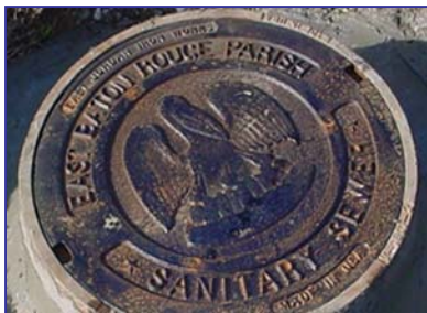
One of the first steps in rehabilitation includes a physical inspection of manholes and pipes to identify blockages.

Rehabilitation of the sewer collection system is a comprehensive physical process that begins with cleaning and inspection of sewer pipes and manholes. Typical rehabilitation repairs include pipe and manhole replacement and trenchless technologies that minimize above ground disturbances, such as cured-in-place pipe liners.